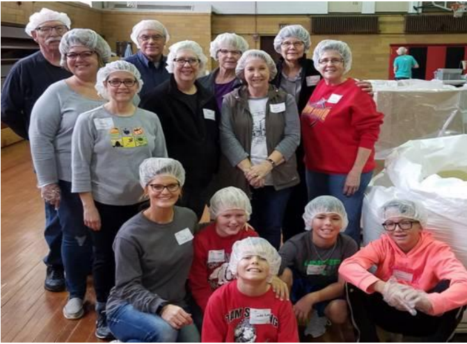
TEAM ZION - Packing MEALS FOR THE HEARTLAND. $400.00 donation from Zion.